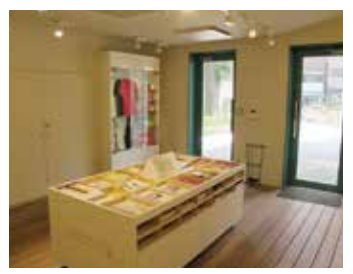
🚯 Ochadai Information Plaza