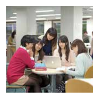
The Career Café offers a place for casual conversation and functions as a new intellectual space for students to host their own events.

Wireless access is also available at many common areas in the campus.