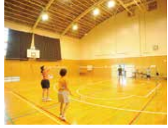
🚺 University Gymnasium