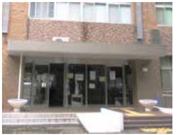
🚺 Science Building 1