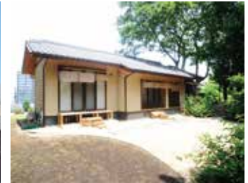
🙆 Tea-ceremony House