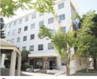
Inter-Faculty Building 3