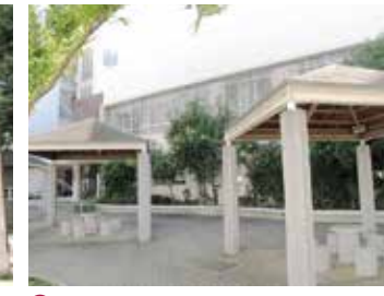
Inter-Faculty Building 2