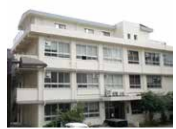
Main Building 2, Human Life and Environmental Sciences Building